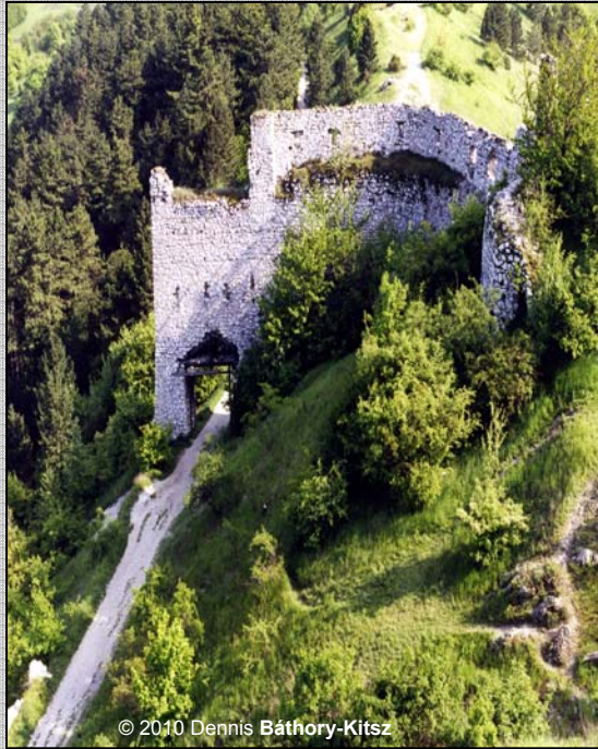
Entrance to the Castle Csejte before its restoration

"The strong Erzsébet that has fascinated so many women is the Erzsébet that I try to portray in this opera...I want to pose the question "Is she you?"